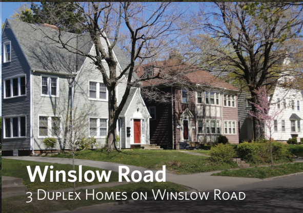
Winslow Road 3 DUPLEX HOMES ON WINSLOW ROAD

B OTH SMALL AND LARGE GROUPINGS OF DEMONSTRATION HOMES were constructed on Parkland Drive, Van Aken Boulevard, Courtland Boulevard, and South Woodland. Each home was architecturally distinct, but also built in harmony with both surrounding structures and the natural environment. Designs for the demonstration homes employed the three recommended architectural styles for Shaker residences: English, French, and Colonial. The sturdy yet picturesque homes offered a vision of permanence within a highly landscaped rural setting. These demonstration homes were a symbol of the dignified, enduring community that the Van Sweringen brothers desired to create and market. As evidenced by the Van Sweringen Co. advertisement on the front of this card, the brothers imagined Shaker Heights as "a city upon a hill."