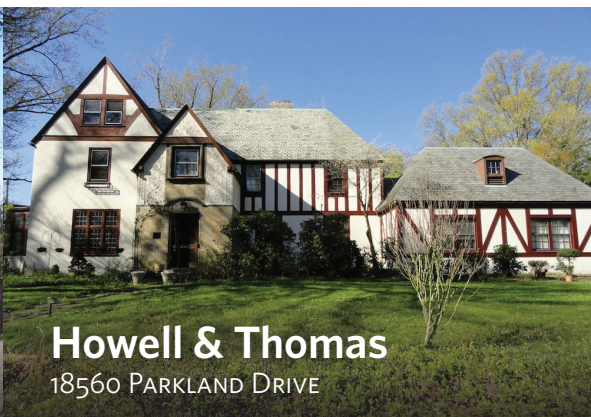
Howell & Thomas 18560 PARKLAND DRIVE