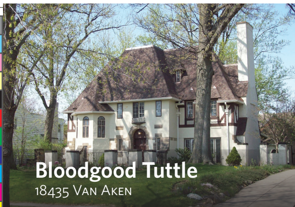
Bloodgood Tuttle 18435 VAN AKEN