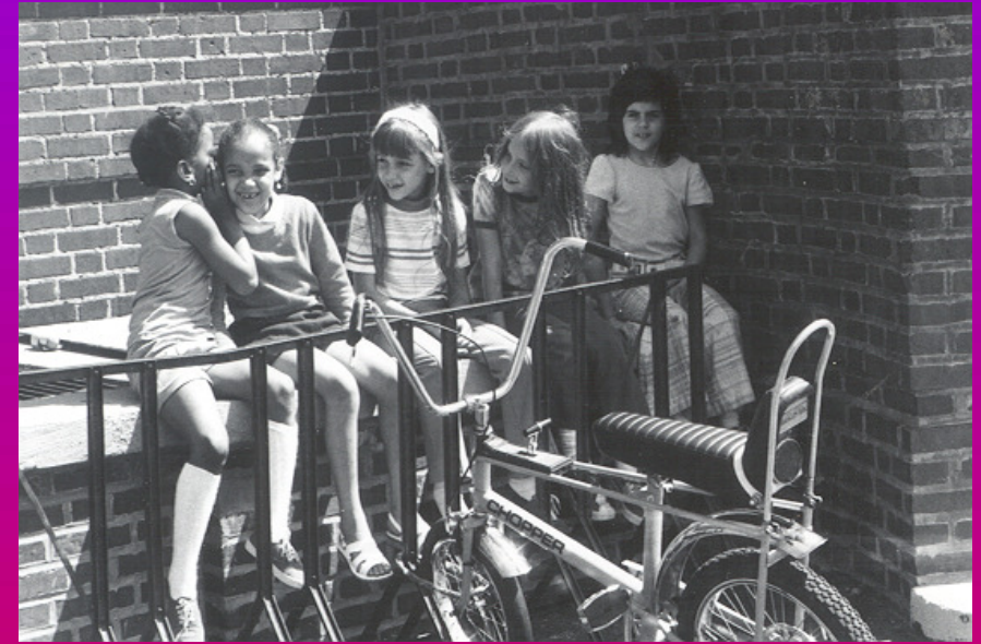
...and play at Moreland School