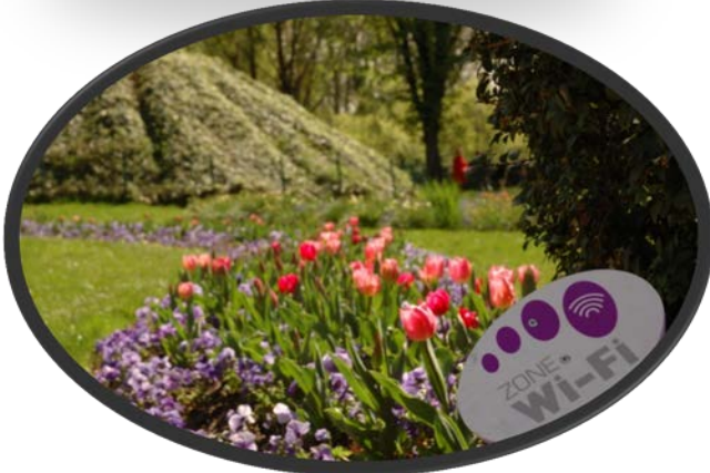
WiFi in the parks (57.7%)