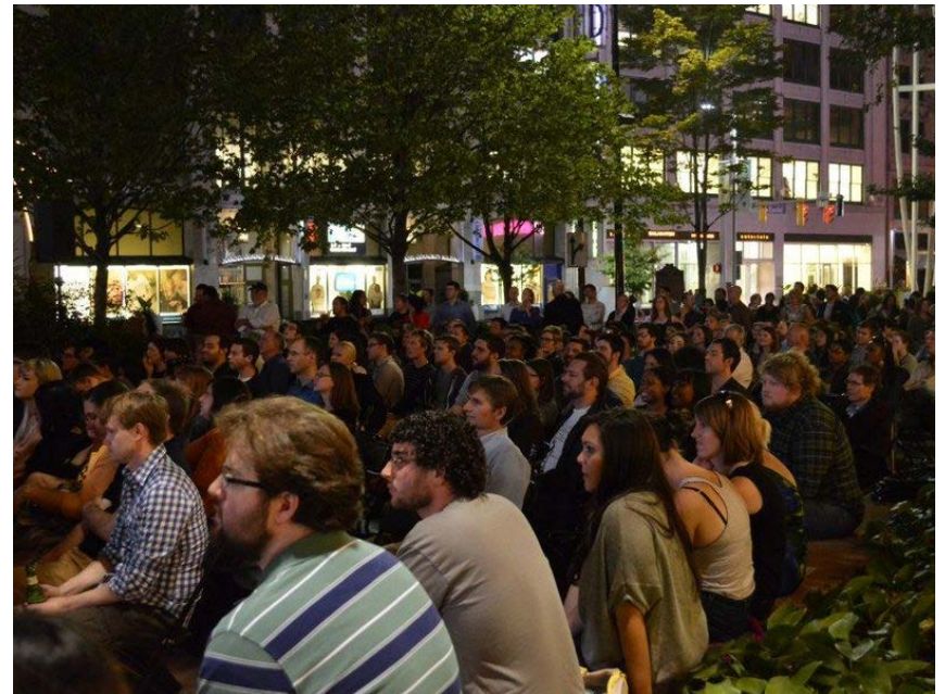
PechaKucha at the Hofbrau August 2015