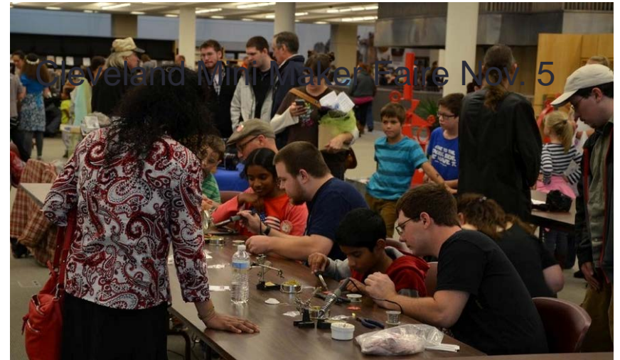
Cleveland Mini Maker Faire Nov. 5