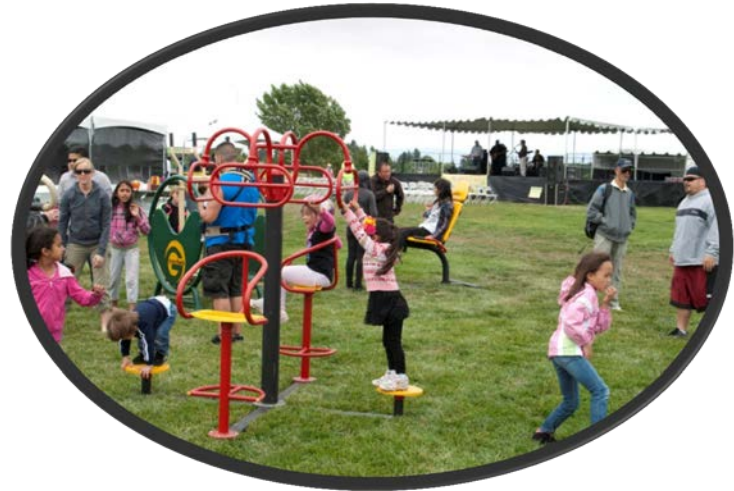
Fitness equipment (57.7%)