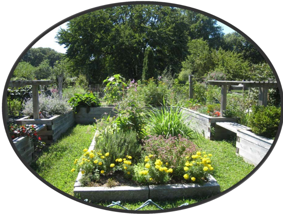
5. Community gardens(61.5%)