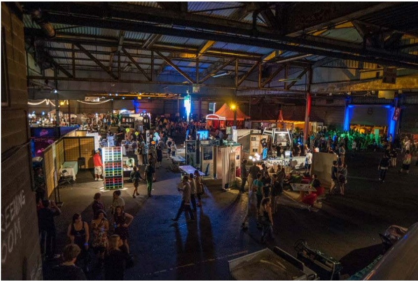
IngenuityFest Sept. 23-25