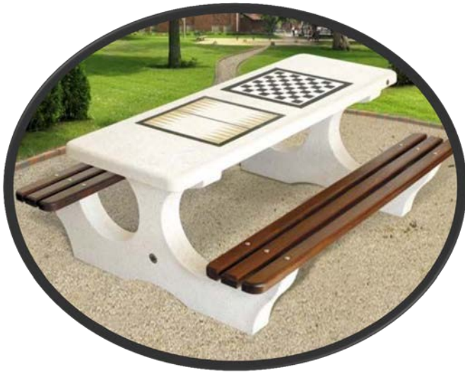
Chess boards/tables (57.7%)