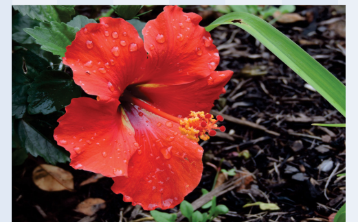
The color photography of Paula Friedman will be on display from September 5-30.

The second floor of Main Library is home to the Shaker Art Gallery, where local artists can display and sell their art. Interested artists can submit an application online from the Library's website.